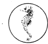
PLATE N° 9